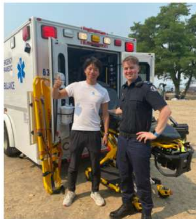
Will smiles with a paramedic at Crescent Beach's Water Safety Day.