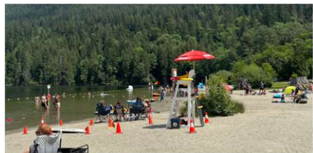
The Lifeguard tower overlooking the beach at Buntzen Lake.