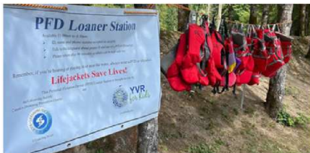
The PFD Loaner Stations at Buntzen and Hayward Lakes were a hit, doubling last season's numbers and promoting water safety.